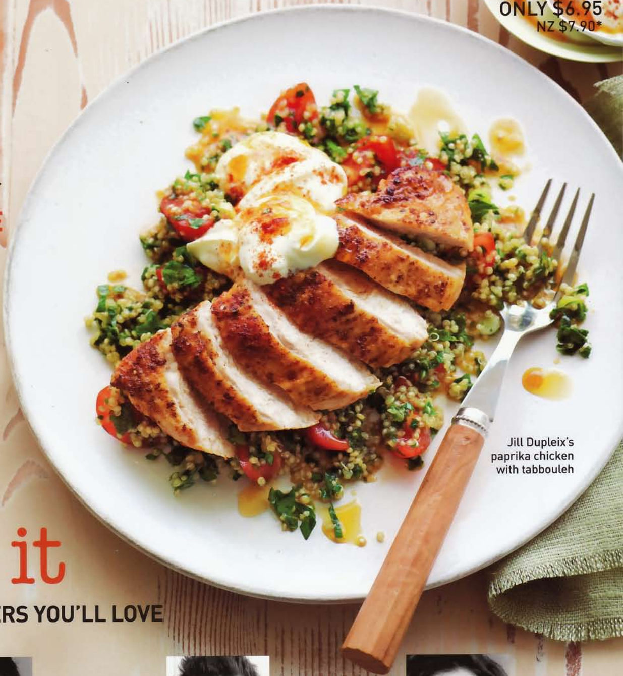
Jill Duplex's paprika chicken with tabbouleh